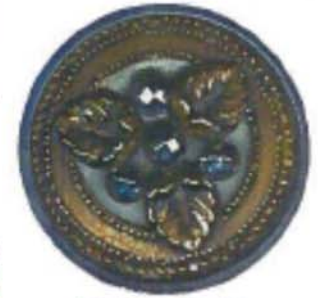
Steel cup. Border interrupted by the leaves.

INTERRUPTED A border that has a break or interruption from continuing around the button.