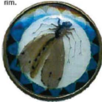
RIM: Brass rim around painted fly and saw-tooth border on a ___ button.