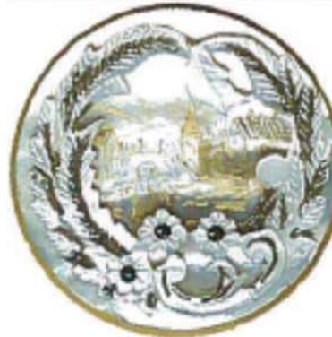
Engraved pearl and gilt. Cut steel OME. Stylized plant life border. This is an uneven border, but it is NOT an interrupted border.