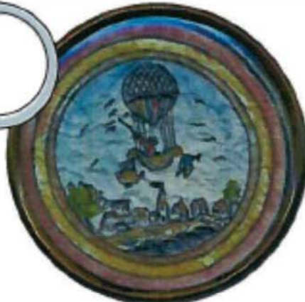
RIM: Painted ___ with brass rim.