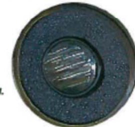
FRAME: Glass set in japanned metal. Galena frame border. Brass rim.

Western Regional Button Association is pleased to share our educational articles with the button collecting community.