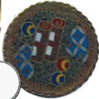
EDGE: Enamel. Rope edge border.