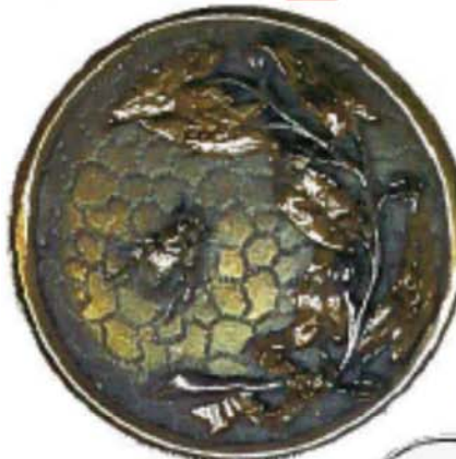
RIM: Brass with brass rim.