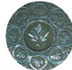
OS: Pewter. Shamrock border.