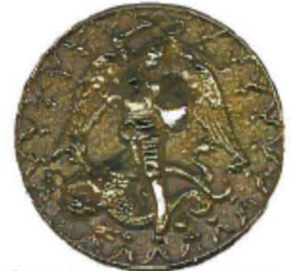
Stamped brass. Border interrupted by dragon head, hand and sword.