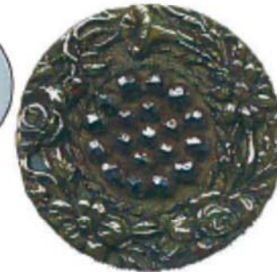
OS: Stamped brass with steel OME. Rope border and rose & morning glory border.