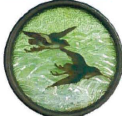
RIM: Gln barl with white metal rim.