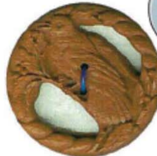
Pierced burwood. Rope border interrupted by bird tail and head.