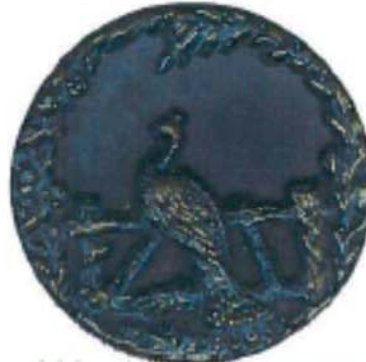
Original tine peacock. Plant border interrupted by bird tail.