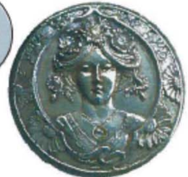
French White button in an art nouveau interrupted border of daisies.