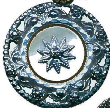
White metal with a pierced plant life border.