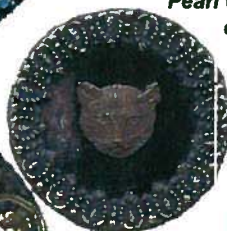
Velvet background behind a cat's head with a leaf rim border.