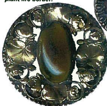
Large jewel, glass set in pierced brass, with a border of water lily leaves and blooms.