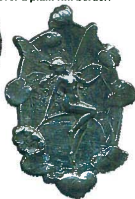
French White button of a fairy In an art nouveau border of water lily leaves and blooms.