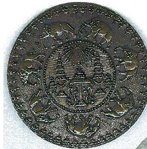
Six elephants on inner border.