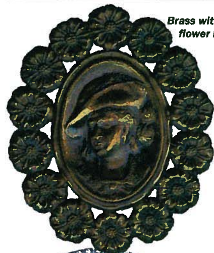
Brass with pierced flower border.