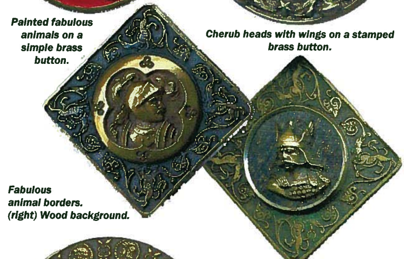
Fabulous animal borders. (right) Wood background.