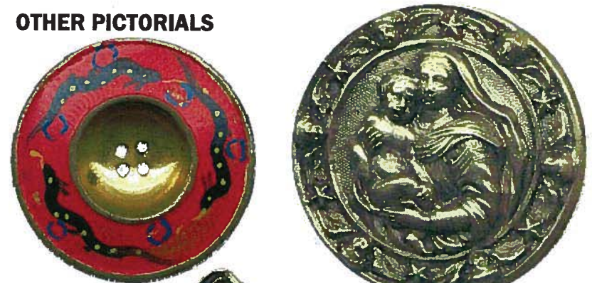
Painted fabulous animals on a simple brass button.