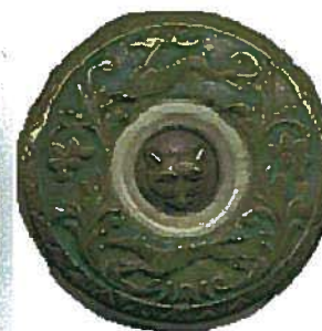
Deer and hound border.