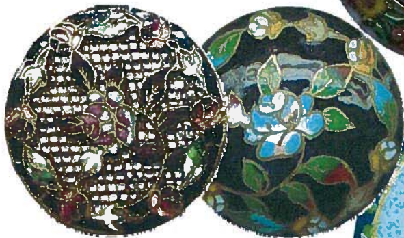
Enamel buttons, one with a pierced screen background, depicting a central rose surrounded by a border of alternating six roses, three rose leaves, and three buds.