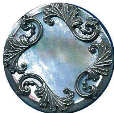
Pearl with an acanthus leaf border over a plain rim border.