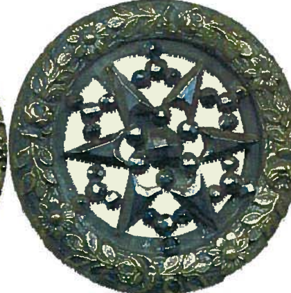
Top row: Amethyst glass set in brass. Black glass set in brass with a stamped brass border of grapes and grape leaves. Four lower buttons are stamped brass.