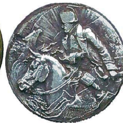
Two eagles on border.