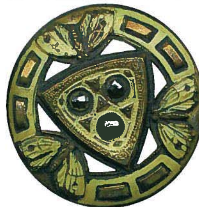
Three insects on border.