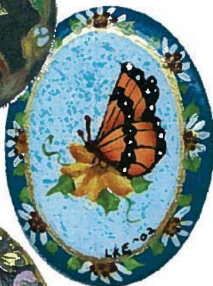
Painted studio button with a gold line border inside a flower and leaf border.