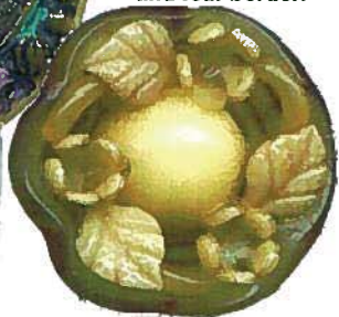
Glass set in brass. Painted borders of an inner rope/cable and painted plant life.