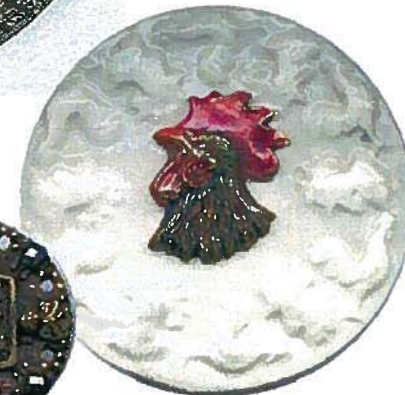
Porcelain with six each rooster & rooster heads on the border. MMF.