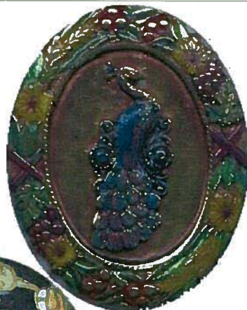
Fruits, grain and flower border.

When gathering buttons for competition specifically for pictorial plant life borders, be sure to not include borders that only contain stylized plant life, as this is classed as a pattern border, not a pictorial border. Thoughtfully review the features.