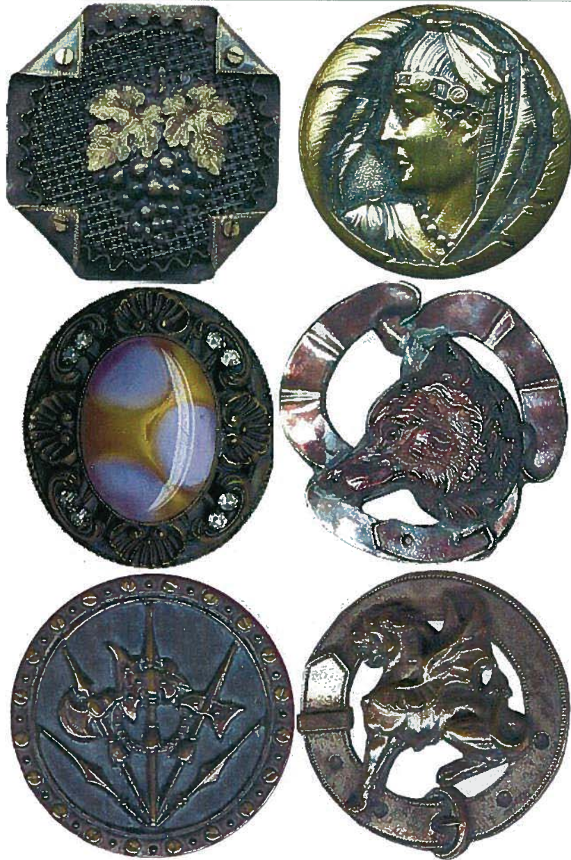
(clockwise from top left): Brass grapes, screen background and a handkerchief border with screw heads. Feather border. Belt border. Belt border. Screw head border. Shell border.