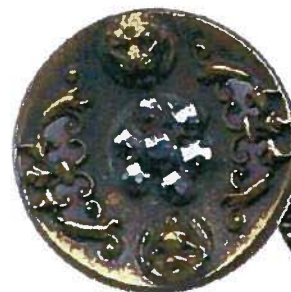
Two lion heads.