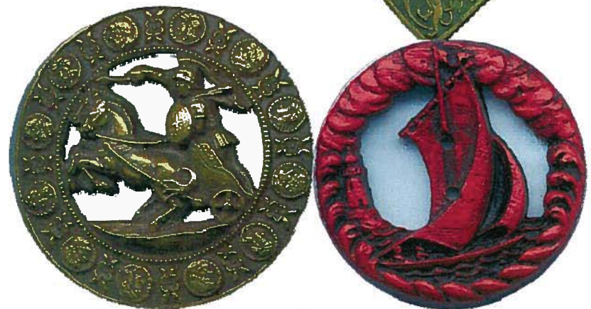
Greek head border. Pierced stamped