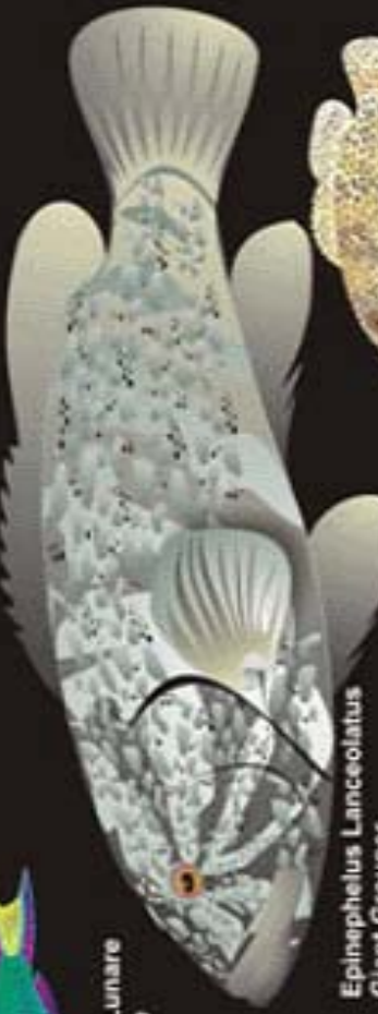
Epinephelus Lanceolatus Giant Grouper