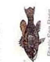
Black Sea Bass