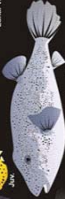
Arothron Stellatus Starry Pufferfish