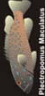
Plectropomus Maculatus Spotted Grouper