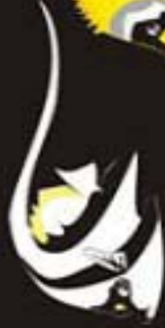
Heniochus acuminatus Bannerfish