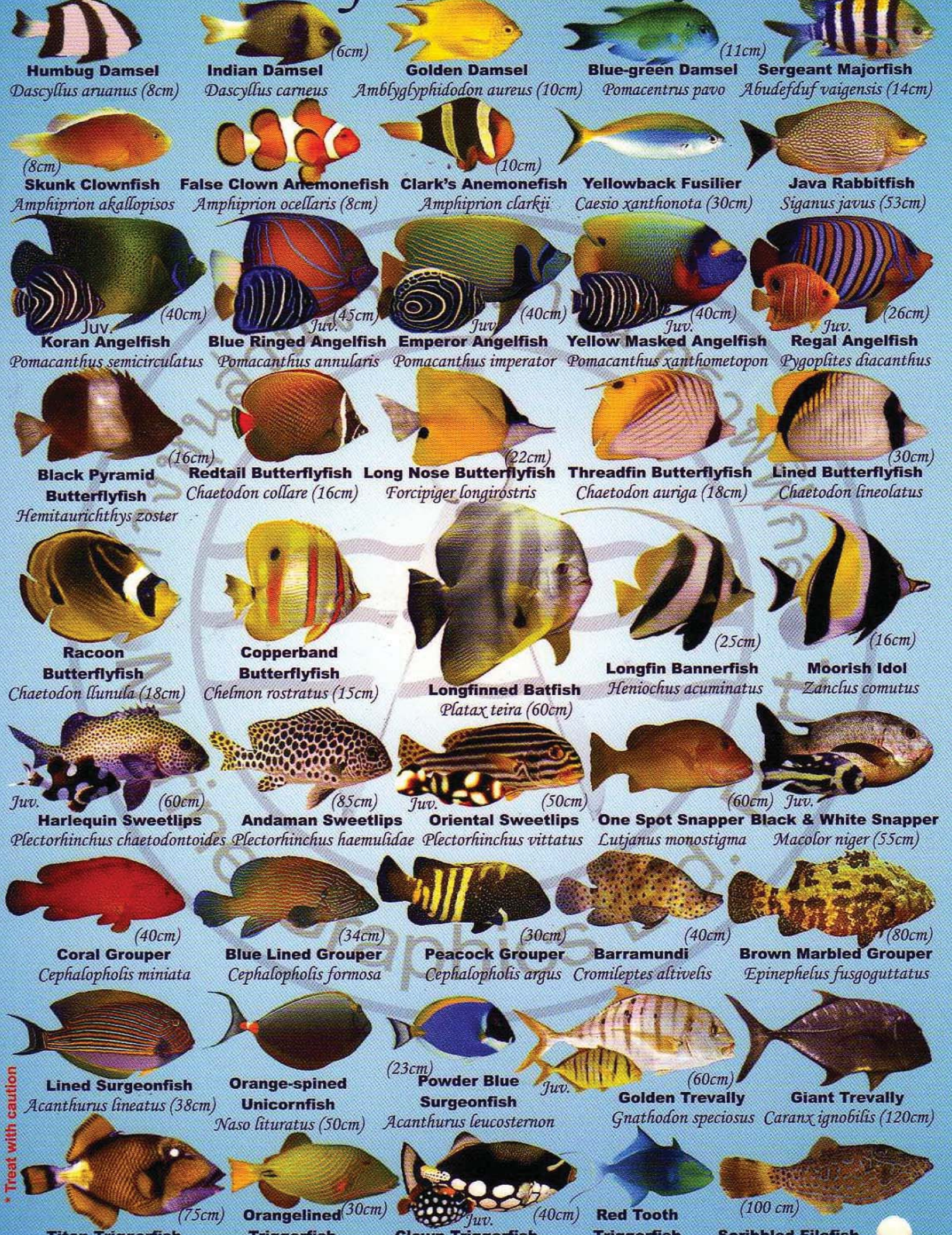
Humbug Damselfish Dascyllus aruanus (8cm)