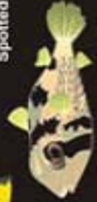
Diodon Liturosus Porcupinefish