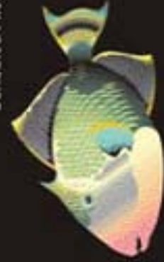
Pseudobalistes Flavomarginatus Yellow-Margin Triggerfish