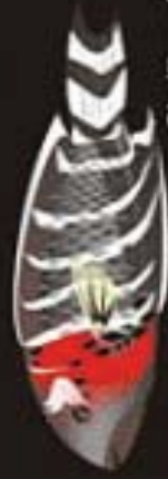
Chelinus Fasciatus Red-Breasted Wrasse