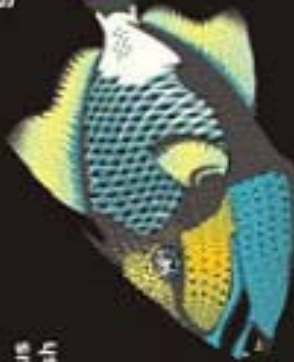
Balistoides Viridescens Titan Triggerfish