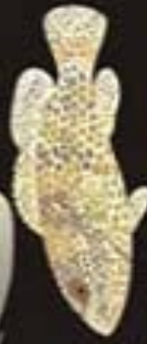
Epinephelus Merra Honeycomb Grouper