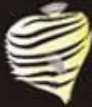
Chaetodon Octofasciatus Eight-Stripe Butterflyfish