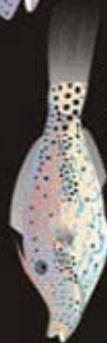
Aluterus Scriptorius Scribbled Filefish