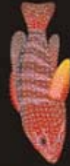
Cephalopholis Miniatata Coral Rockcod