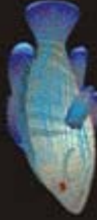
Cephalopholis Formosa Bluelined Grouper