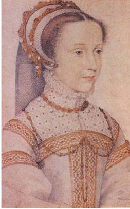
Sketch of Mary by Clouet